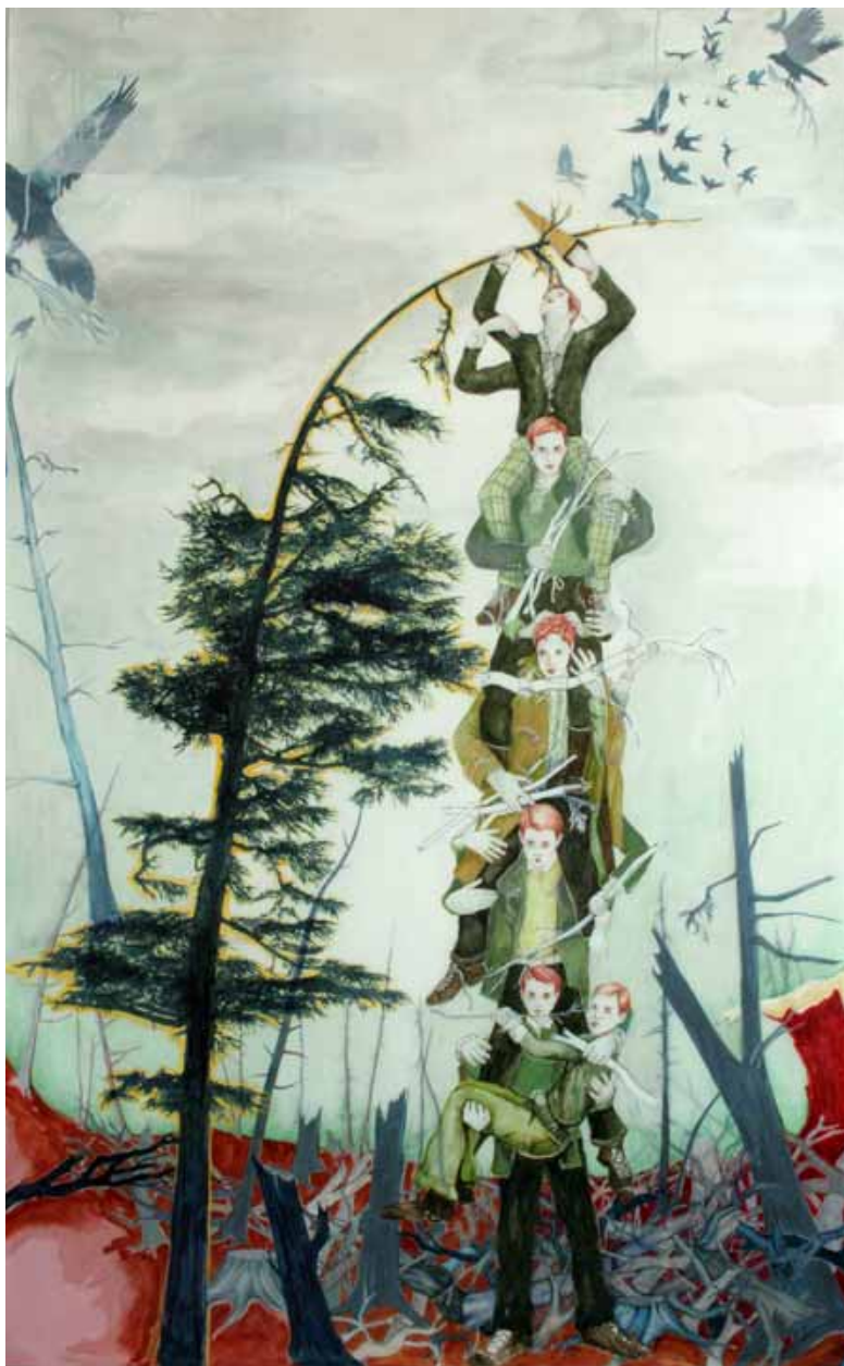
Anthony Goicolea, Disassembly , 2006. Mixed Media on Mylar, 53 x 36" Collection of Allen G. Thomas Jr.

Visual Thinking Strategies work best with art work that is open to interpretation: they should contain a number of valid readings, and several possible meanings, even levels of meaning. This allows an intriguing challenge, and it also justifies a range of viable viewpoints. The more a work is open to interpretation, the more likely the viewer's intuition is reasonable. Pictures that are less clear encourage speculation, questioning, and complex interpretations.