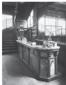
Eugène Atget The Wine Seller , 15 Rue Boyer, ca. 1930 Gelatin silver print (printed by Berenice Abbott) 9 x 6 1/2 in. Chrysler Museum of Art, Gift of Walter P. Chrysler Jr.

6 pm Members' Opening Lecture and Reception for Twilight Visions JC