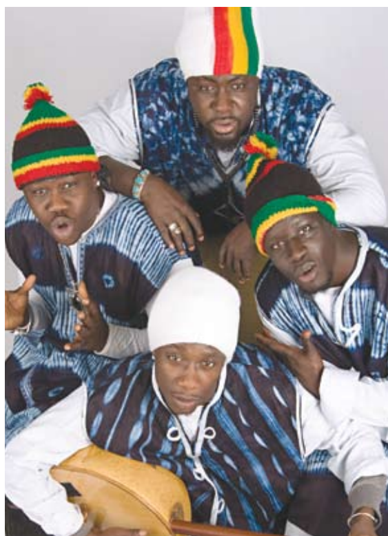
Top: Farai Chideya